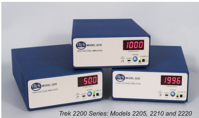
Trek 2200 Series: Models 2205, 2210 and 2220

Industries that will benefit from the advancements enabled by these high-voltage amplifiers are diverse and include aerospace, biotechnology, defense, military, power, R&D, semiconductors, and electronics.